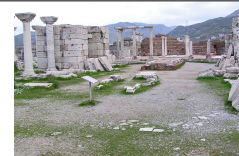
Basilica of John