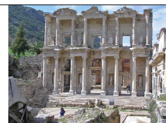
Library of Celsus