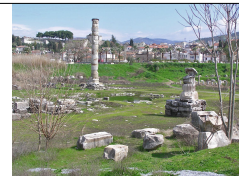
Temple of Artemis

The Temple of Artemis: "So not only is this trade of ours in danger of falling into disrepute, but also the temple of the great goddess Diana may be despised and her magnificence destroyed, whom all Asia and the world worship" (Acts 19:27). Pausanias: "most worshiped in Mediterranean world" (Archaeological Study Bible).